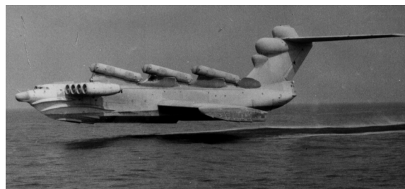
Fig. 1. Ekranoplane Lun

Unfortunately, ekranoplane has the essential instability of motion in the longitudinal plane and perfect automatic control system is necessary first of all for providing the flight stability. It has been proofed during the operation of the big Russian ekranoplanes Orlyonok and Lun (Nebylov and Wilson, 2001).