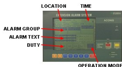
Fig. 2. Extension Alarm Panel

The extension alarm panel of IEAS is equipped with a LCD (Liquid Crystal Display) in addition to various function buttons. Figure 2 shows an extension alarm panel of IEAS.