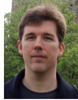
Publications Paul Goulart ETH Zurich