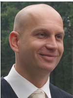
Workshops Maurice Heemels Technische Universiteit Eindhoven