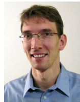
Exhibitions Markus Waibel ETH Zurich